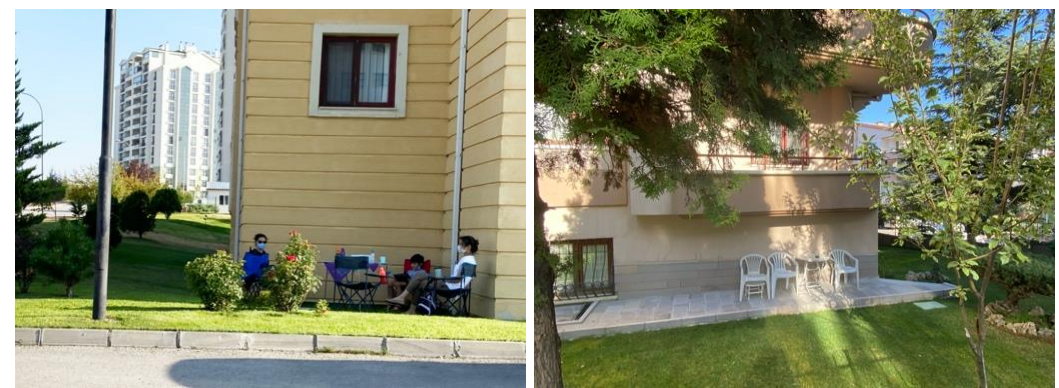
Figure 4. Examples of the use of the back/front gardens in Study Area A and Study Area B, respectively.

during the pandemic, terraces are determined as the least used contact spaces for 47 (78.3%) of the residents of Study Area A, while in the front gardens of the building blocks are determined as the most frequently used contact spaces for 13 (21.7%) residents. According to the results of Study Area B, in a similar way, terraces are determined as the least used contact spaces for 44 (73.3%) and doorsteps are determined as the most frequent contact space for 10 (16.7%) residents. When the averages of the usage frequency of these outdoor spaces are compared for the uses before and during the pandemic, some of the apparent results are as follows. During the pandemic, it is observed that the usage of outdoor spaces increased by 12.9% and 24% in Study Area A and Study Area B, respectively. Especially, 7.2% increase was determined in the usage frequency of back/front gardens in both study areas (Figure 4).