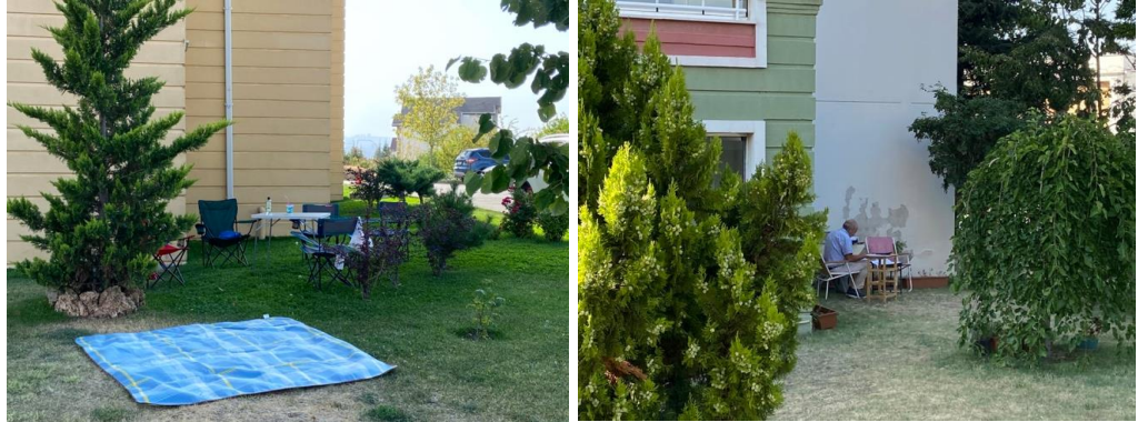
Figure 5. Examples of clean and well-maintained open spaces that integrate with nature in Study Area A and Study Area B.