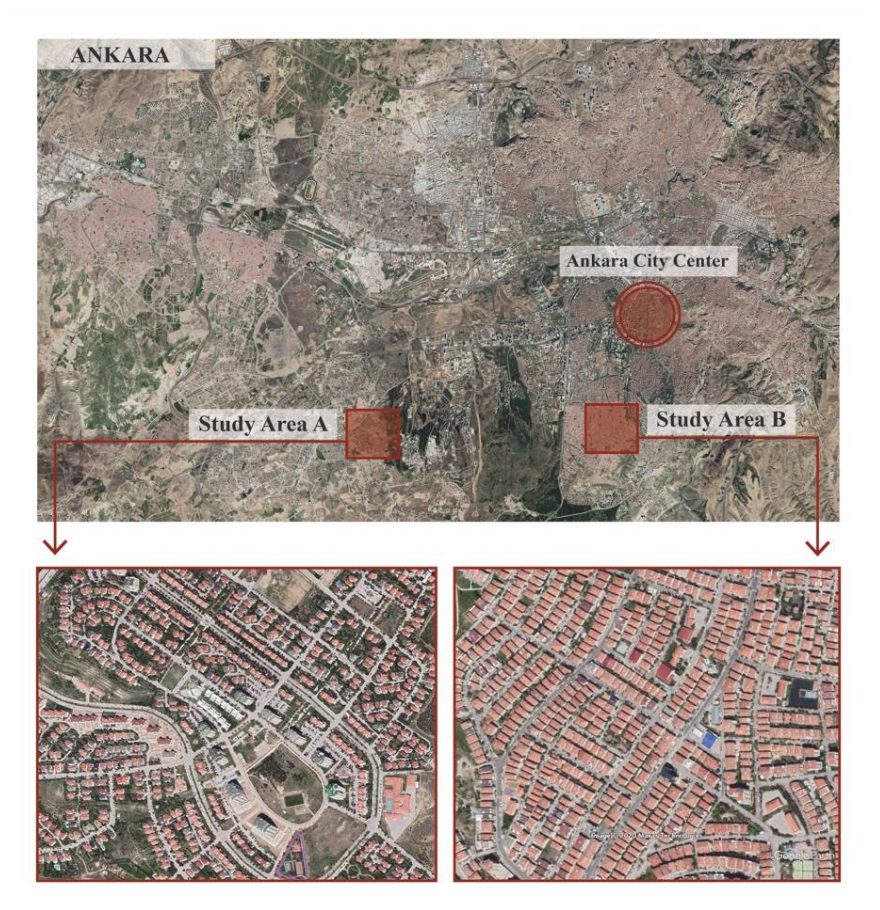
Figure 1. Study Area A and Study Area B from Ankara, Turkey

questionnaire was designed to gather information on the residents' perceptions on the adequacy and function of outdoor spaces for social interaction and filled out by a total of 120 volunteer residents: 60 from Study Area A and 60 from Study Area B. All of these data were collected from volunteer residents in the apartment blocks that were surrounded by open spaces. Further, face-to-face in-depth interviews were conducted with 30 residents who coincided with the place-making activity during the observations made in the study areas. The questions asked in this section are open-ended, based on understanding the purpose of use of outdoor spaces in the pandemic process and their contribution to social integration, as well as to identify problems and suggestions regarding these recent potential areas.