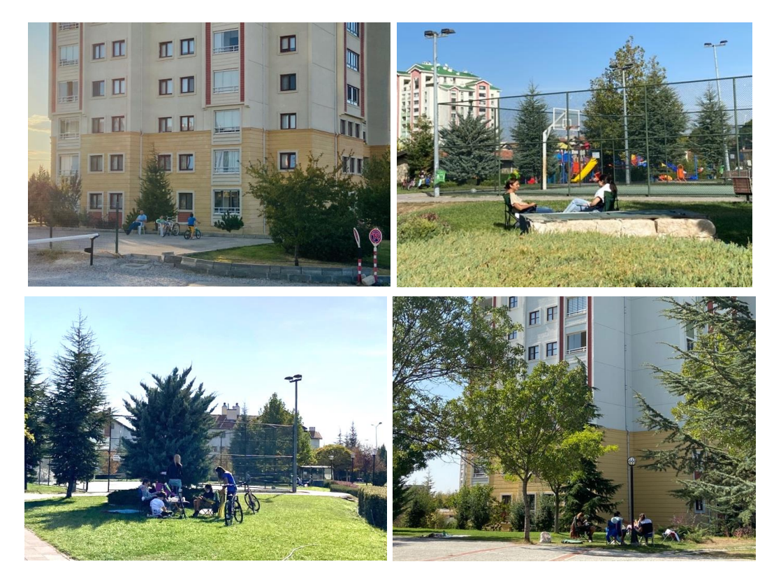
Figure 3. Use of outdoor spaces adjacent to parking lot, children's playground, sports area and green area; respectively.

During the pandemic, the most common activity that takes place in these outdoor spaces is sports/exercise/walking by 36 residents in Study Area A, and chat/conversation by 35 residents in Study Area B. The rarest activity detected is work declared by 4 and 7 residents for both study areas, respectively. It is also found that, of the residents in Study Area A, 14 (23.3%) use these spaces every day, 29 (48.3%) use them weekdays, 7 (11.7%) use them weekends; while of the residents in Study Area B, 15 (25%) use these spaces every day, 26 (43.3%) use them weekdays, 18 (30%) use them weekends. Also, while 10 (16.7%) of the residents in Study Area A do not use these spaces, 1 (1.7%) of the residents in Study Area B does not. The time interval when these outdoor spaces are used extensively has been determined as 18.00-20.00 on weekdays and 14.00-18.00 on weekends for both study areas.