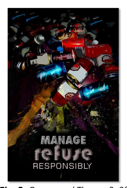
Fig. 3: Consumers' Theory, 2x3ft

On their parts, Nigerians are known for huge and elaborate delivery of alimentary provision during social events. Onuzulike and Obodo (2012) discussing Olanrewaju's effort in engaging numerous plastic grocery packages in his work notes that such materials are "sourced from the streets and refuse dumps..." (p. 106). Cans of beverage and soft drink seem to be abundant amongst packaging materials. Plastic bags also form the bulk of wrapping and packaging materials used by consumers in the market. Such materials are non-biodegradable and thus constitute much of the environmental degradation across Nigeria.