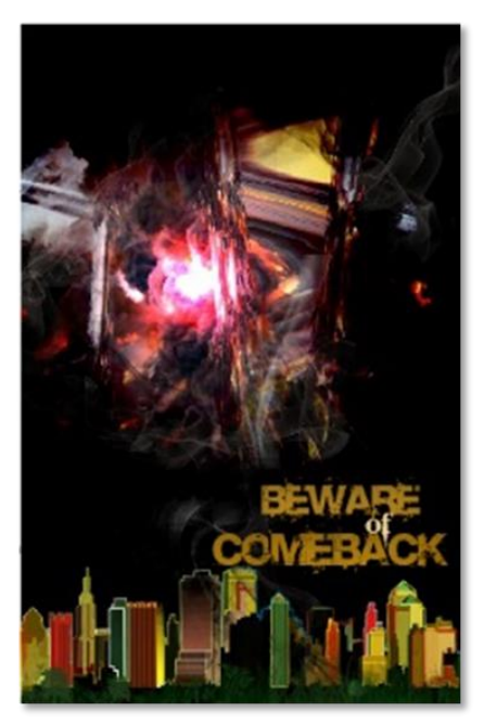
Fig. 2: Ozone Layer, 4x6ft

My visualisation of conflagration and emission as subtle and dangerous affordance of economic and industrial development is further revealed in the concept of Ozone Layer (Fig. 2). This piece emerges from a photographic image of inferno from an explosion as its primary visual data. Within my digital studio the pillar of smoke was copied in duplicate layers and adjusted differently using Photoshop Filter>distortion> wave effect. A lens fare filter was equally added on a black background which was superimposed above the first two layers to form the new image hybrid. Smoke effect was added using the brush tool while the piece was finished as a poster design by adding a representation of cityscape and text.