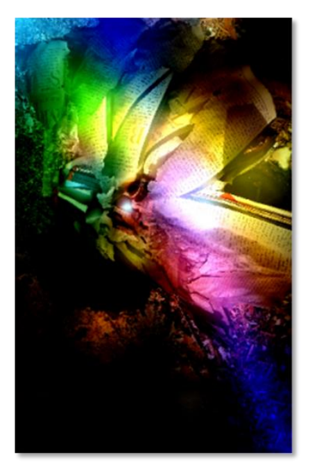
Fig. 1: Rainbow damage, 2 x3ft