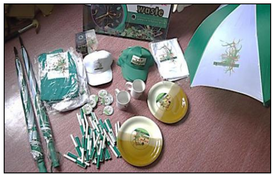
Fig 7: Samples of designs reproduced on functional products

In all, this project, with its materials, and procedures has shown design outputs which form a visual language on issues of climate and environmental problem facing Nigeria. It has further provided insight into the cognitive interpretation and analysis of the ideas and values they connote as visual language for Nigeria. The design elements such as colour and forms are potently engaged in these works to signify the dangers and changes we face while the use of words on this art works serves as anchors to buttress the message expressed. The works therefore, as visual language, connect strongly with Frank's (2006) assertion that "the ideas, values and approaches that constitute the basis of the visual arts can continue to enrich our lives and surrounding. We form art. Art forms us" (p.475).