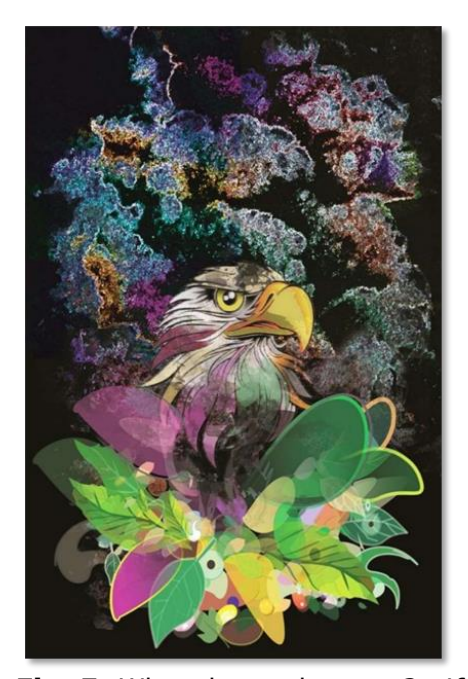
Fig. 4: Inclusive Preserve, 6x4ft