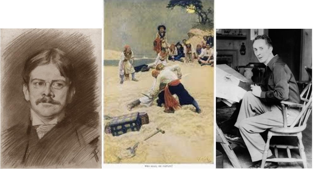
Edwin Austin Abbey