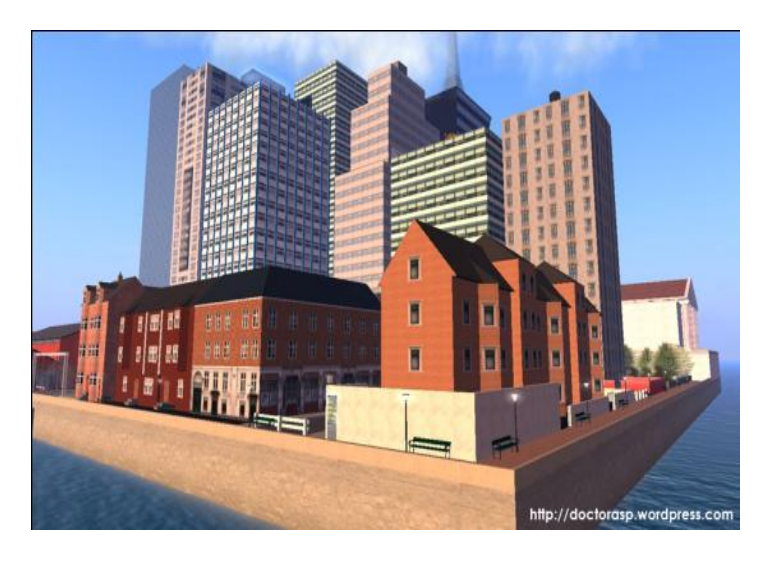
Figure 1. View from Metrotopia: The City of Superheroes and Heroines