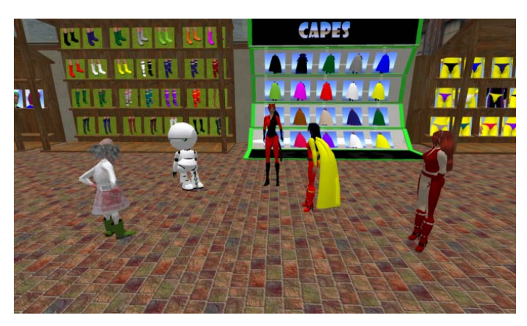
Figure 4. Metrotopia design team members in an inworld design meeting

potentials through collaborative action. Rhetorical intentions of the social actors diverge, and formations of design teams are often in flux. The design methods show variations depending on the structure of teams and preferences of each individual co-designer. Similarities also exist in terms of collaborative evaluation and modification of designs, and the ways in which the co-designers conceptualize the needs for avatar interaction. In both cases, several participants met in both physical and virtual places for different purposes during the process. In Metrotopia, the physical meetings were used for concept generation and project development (Figure 4). As mentioned above, the entire PAL team has never met in person, and all of their collective decision-making processes are organized in SL (i.e. Figure 5).