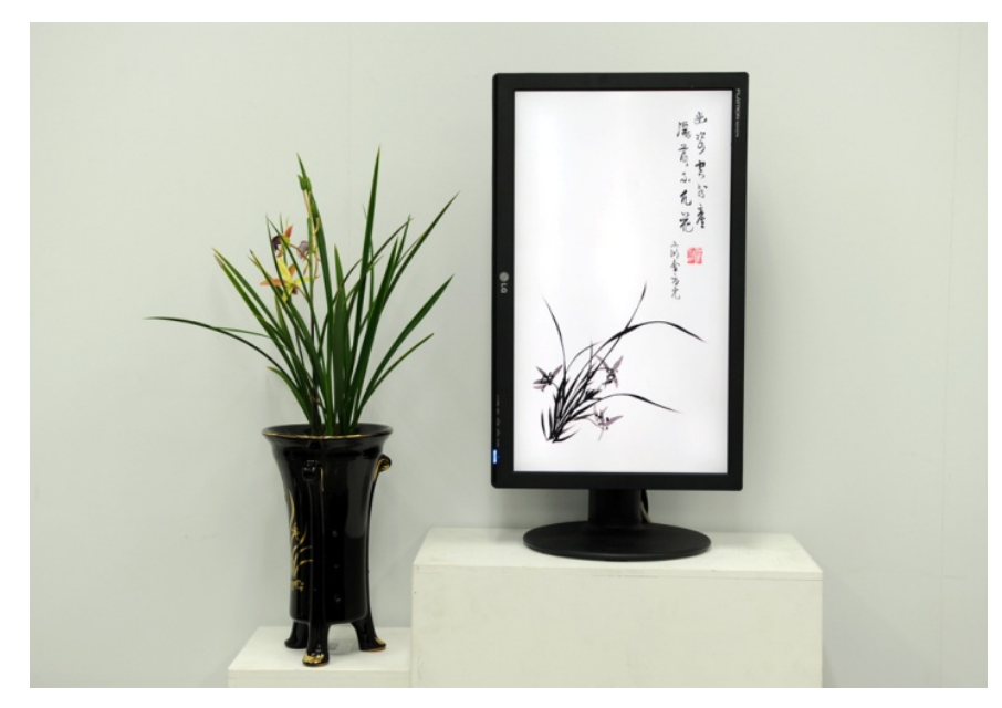
Fig. 4. Digilog Orchid.

The digilog orchid consists of a simple system. A very thin band sensor is attached to the back of an actual orchid leaf so that the orchid drawn on the monitor has the same bending angle as that of the actual orchid. The use of a thin sensor has the advantage of capturing the degree of bending in a delicate manner.