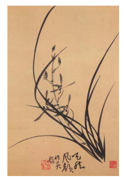
Fig. 3. Traditional Ink-and-Wash Orchid Painting.

As spirituality and scholarly ideas are closely associated with orchids, there are several rules guiding orchid representation, which contain philosophical meanings.