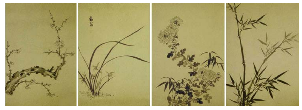
Fig. 1. The Four Gracious Plants traditionally portrayed in ink-and-wash painting

to four illustrious generals from the DongZhou Dynasty. (The ancient Chinese reformation period from B.C. 8 century to B.C. 3 century) Who were renowned for their great dignity.