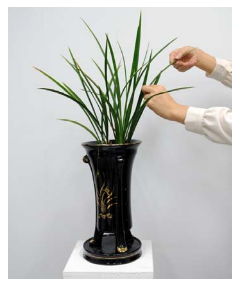
Fig. 2. Oriental Orchid.