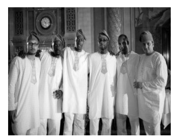
Plate I: Men Social Group in Group Outfit

83 respondents which accounted for 100% of the consumers, 39 (47%) and 38 (45.8%) agreed and strongly agreed respectively that the contemporary textile products