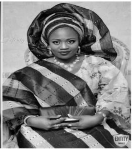
Plate VIA: A woman on aso-oke and lace