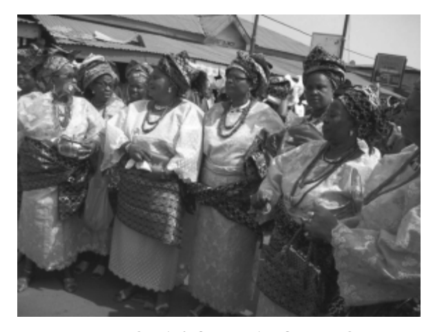
Plate II: Women Social Group in Group Out