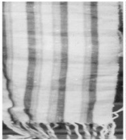
Plate III: Kijipa Fabric (aso-oke)