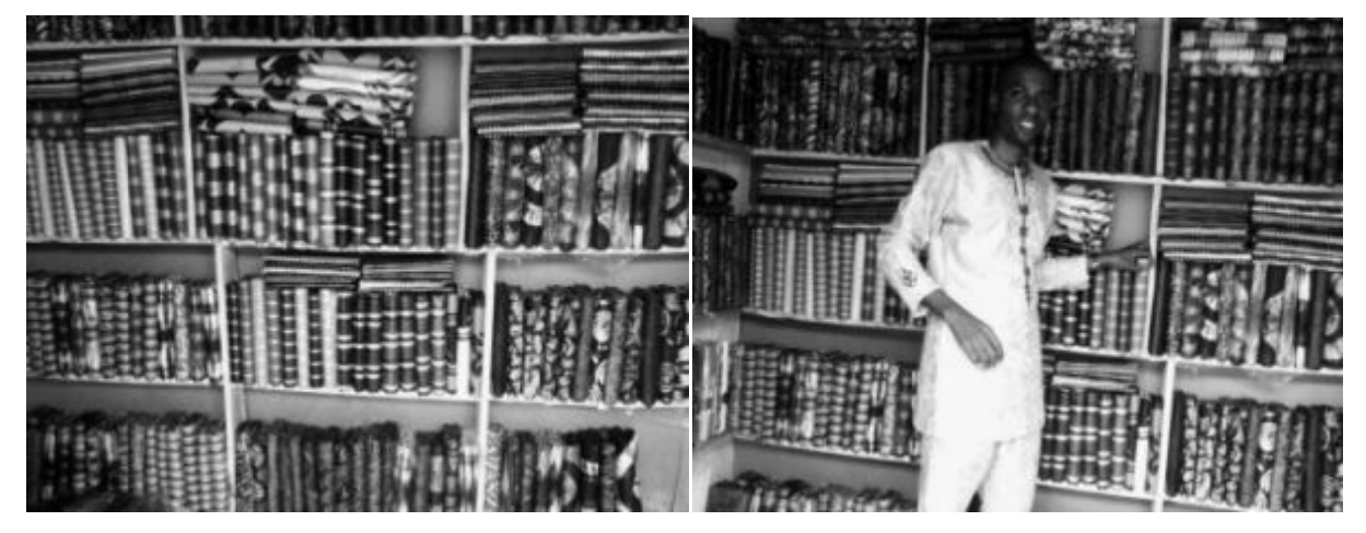
Plate VII: Handcrafted textile products in a Market stores in Abeokuta

The respondents acknowledged the fact that the quality of handcrafted textile products have improved over the years. The result of the responses revealed that the design and motif on the products are appealing, the creativity and innovation of the practitioners are acceptable, the products are prestigious, they are not heavy and have a good colour fastness. These, among other factors made the products acceptable among the populace according to the respondents. Though scholars in the field of traditional textile technology and local textile practitioners have achieved a great feat that made the products to be acceptable, the products have been continously been bedeviled with myriads of challenges which are responsible for its low patronage as group outfits as revealed by this study.