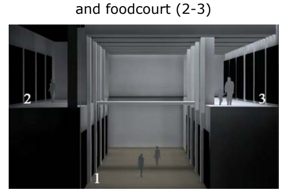
Image3: Model view of Mall-2

Automatic controlled shading system is used only at the glazed roof of Mall-2 for preventing glare. LEED suggests solar control devices unless daylight illuminance level is more than 250 lx, therefore it is reasonable to use control devices for this mall according to daylighting simulation results.